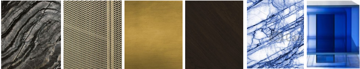
MARBLE, BRASS, WALNUT, SILVERWAVE, ACRYLIC