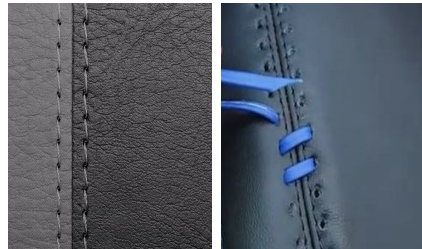
LEATHER WRAPPED JOYSTICK